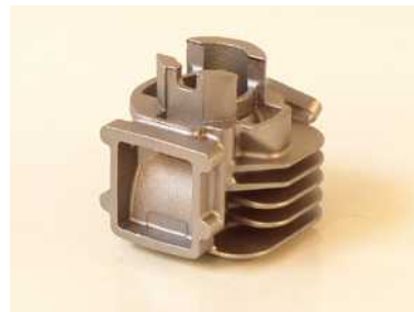
Cylinder- Yamaha - En-GJS-400-15