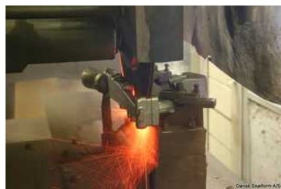
Automatic gating cutting