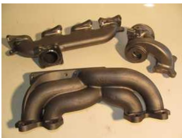
Exhaust parts – 1.4849