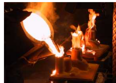
5 x Pouringline