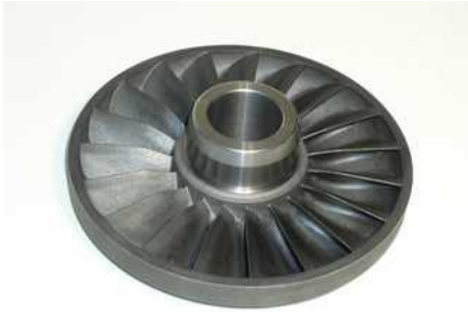
Rotor – EN-GJS 600-5