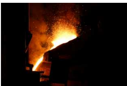
8 x Induction furnaces