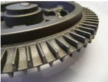
Pumpwheel - Voith