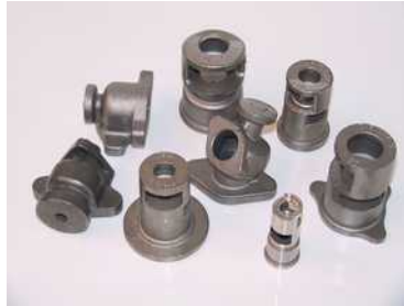
EGR Valves – Nirest - 85 versions Shellmould