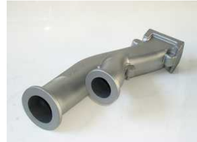
Exhaustpart for doubleturbo – Volvo