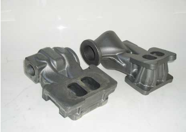
Turbo Exhaust parts - EN-GJS-XSiMo 5.1