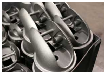
Forklift - Atlet